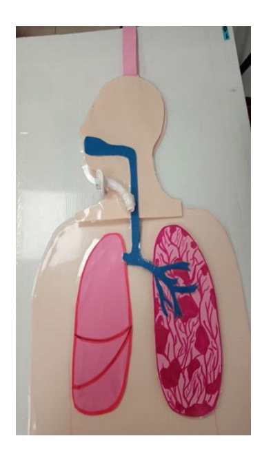
Figure 1. Example of model for description and preparation of farewell by photographs.

The figure shows a model through which the disease process is explained and the measures that are taken by health personnel to improve the conditions associated with the life of a person with Covid-19 and the process of intubation.