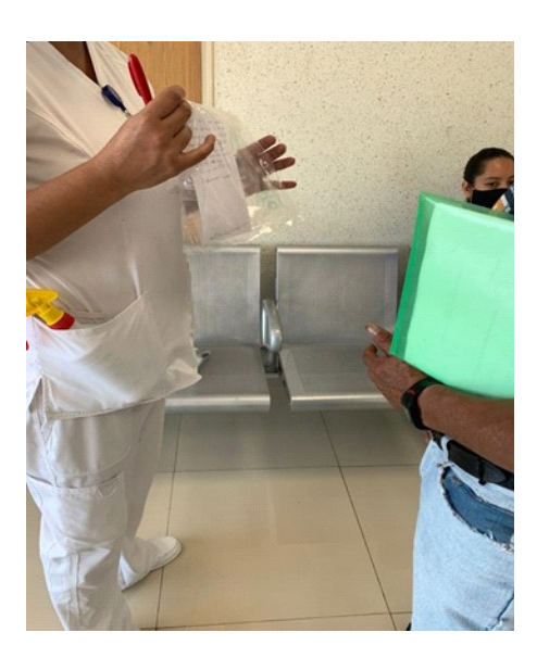
Figure 2. Farewell letter protocol.

The figure shows how health personnel deliver a letter made by the hospitalized patient to the family in the hospital waiting room.